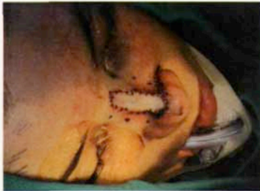
Figure 2. The defect is modified with local tissue transfers to fit within the nasal bridge aesthetic subunit.