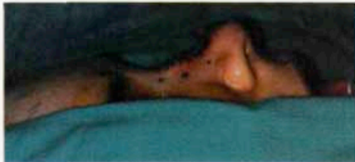
Figure 3. Intraoperatively, there is a poor three-dimensional contour match.

including a left cheek advancement flap, to create a defect that would lie within the boundaries of the nasal bridge aesthetic subunit (figure 2). Despite a poor contour match on the operating table (figure 3), the final result was aesthetically acceptable to both the patient and physician (figure 4). The appearance of the grafted skin was more glassy than that of the surrounding normal nasal skin. Still, the patient was content to overcome this by applying make-up.